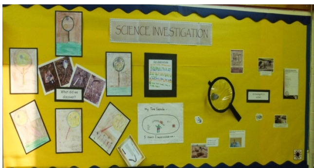
Year 3's display showing the findings of their Investigation.