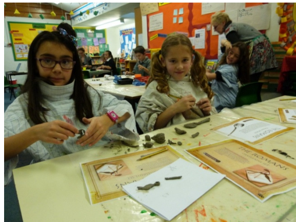
Maple Class created clay reproductions of the artefacts.