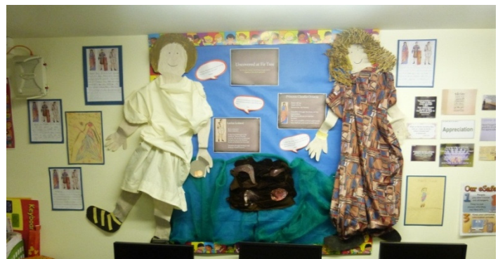
Apple Class' display board to show their findings.